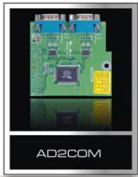
For 2xCOM Ports Added