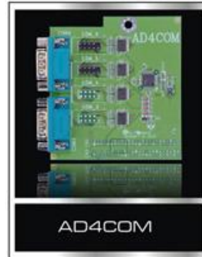
For 4xCOM Port Added