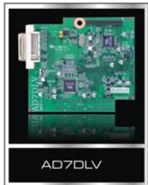
-Extended D-Sub 15-pin and DVI Connectors -VIA VT6136 Support LVDS signal for LVDS Panel -VIA VT6132A Support DVI digital video signal Output