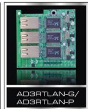
For 2 nd or 2 nd , 3 th , 4 th 10/100 or 10/100/1000 Ethernet LAN