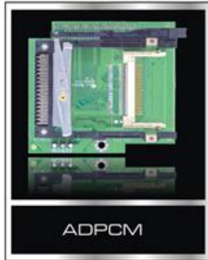
Card Bus Type I + II Supported Expansion Interface With CF Compatible Card Reader