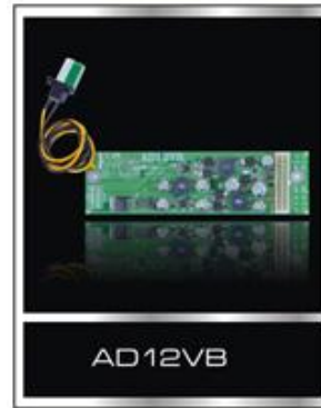
12V Mini-ITX Power supply - 60Watt DC-DC power supply - ATX standard compliant - 12V operation - 100% silent, small footprint