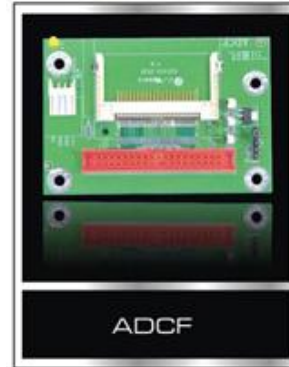
IDE Interface Supported CF Compatible Disk On Module